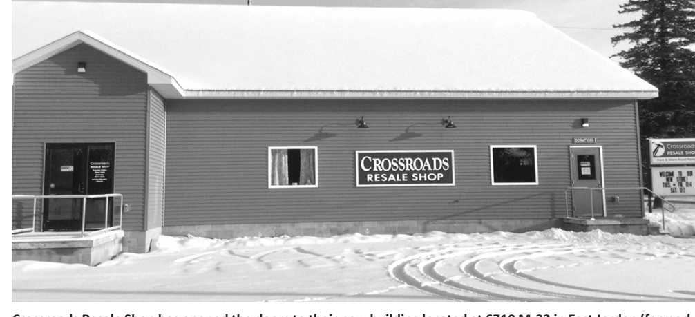
Crossroads Resale Shop has opened the doors to their new building located at 6710 M-32 in East Jordan (formerly

The Crossroads board and staff greatly appreciate the grants and donations that helped make this expansion possible. Many local clubs, groups and individuals volunteered their time to facilitate the move and set up the new store. The result is a beautiful space to help meet the needs of families in our commu-