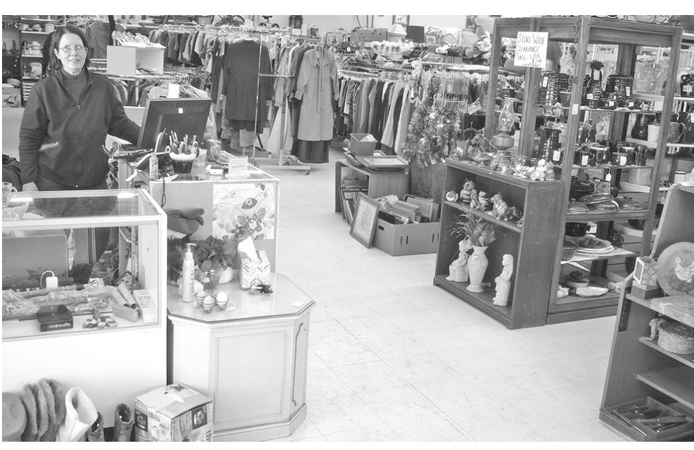
From now until August 1, The Resale Store in Gaylord is offering a 50-percent off sale for their entire inventory.

The Resale Store is bright, cheery and well organized making shopping for terrific bargains a breeze. It offers just about everything under the sun...or across every letter in the alphabet, including books, dvd's, record albums, men's and women's clothing, furnishings, dishes, cook-